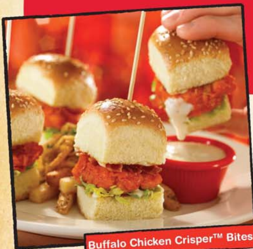
Buffalo Chicken Crisper™ Bites