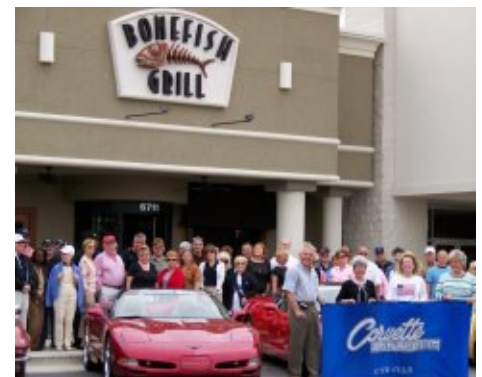
16th Anniversary Dinner Bonefish Grill July 15, 2007