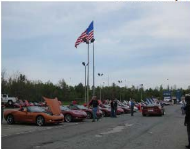
Left: A bevy of some of the approximately 140 beautiful Corvettes and Classics under the Ourisman US Flag. The flag is 15 ft. by 30 ft. and can be seen for miles down Route 50.